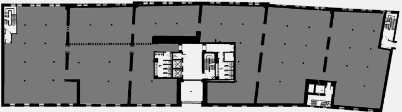
Typical floor plan